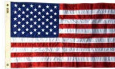
United States Flag

Dimensions: 9" x 14" Legal file folder color: Manila